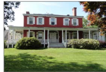
Existing Historic House to be restored